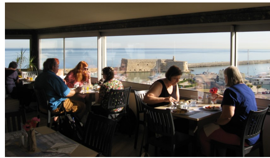
Breakfast looking over the harbor in Crete Plenty of shopping