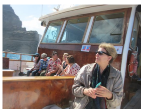
A.Y. and others from our group catching a few rays on our wooden boat ferry from Santorini to the volcano and hot springs and back to a steep tram.

We were very active so we did not do as much of the metaphysical meditations as I planned. Unfortunately, we got kicked out of the lower site at Delphi when we brought out our stones to charge up! Greece is a conservative religious country, so metaphysics needs to be low key- odd since their ancient history was not that way.