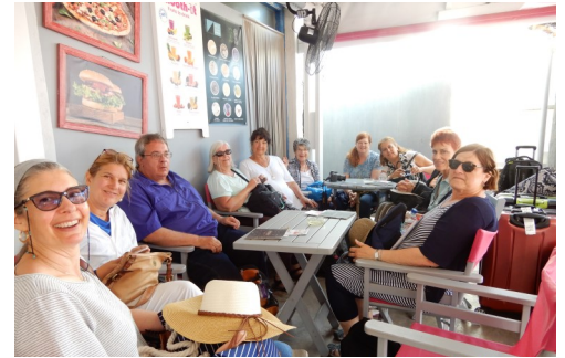
Waiting for the ferry to Mykonos is a social event

Delos is a "must see" and just a short ferry ride from Mykonos. We were blessed with some private time near this special palm tree to do a short meditation. Delos is considered by many to be the most sacred place in Greece. Mykonos is a very popular island with a quaint waterfront. We loved staying at 5-star San Marco hotel.