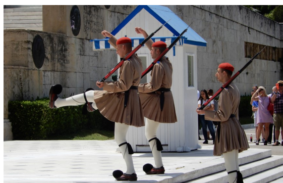
Changing of the Guard in Athens

Most of our group thought Crete was our favorite island. It's big and beautiful. I loved having freshly squeezed orange juice every day.