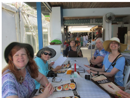
Fresh fish lunch at Matala, the 1960's hippie beach and caves in Crete

In Crete, we visited Knossos, an ancient palace and a must see on Crete. It is a big site and popular with the cruise boats. I liked a smaller site better, Phaestos, as it was quiet and at a very scenic location with great views.