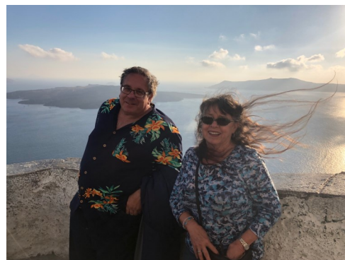
Posing for a photo with K.T. overlooking the volcano in Santorini, ancient Atlantis according to Plato.

We have been to Egypt, a Tanzania safari, and twice to Greece. Sacred travel with like-minded friends takes you beyond the intellect into really feeling the energy of ancient energies..